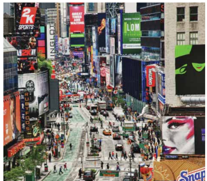
Times Square from outside FPA's new offices on Broadway.