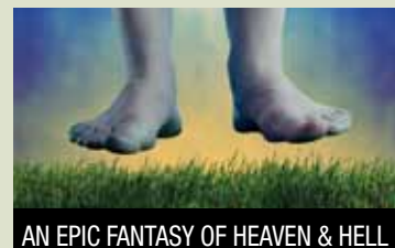
AN EPIC FANTASY OF HEAVEN & HELL